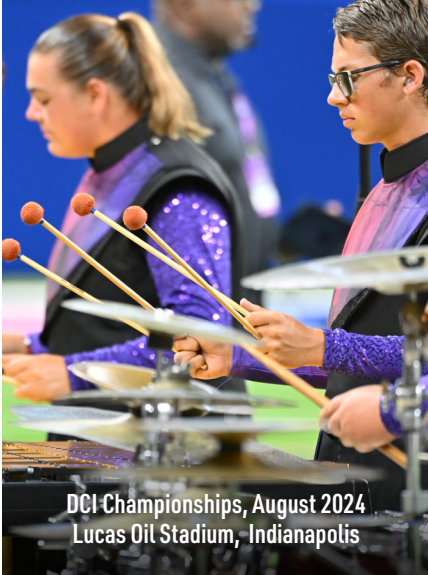
DCI Championships, August 2024 Lucas Oil Stadium, Indianapolis