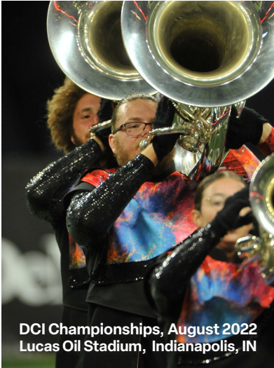
DCI Championships, August 2022 Lucas Oil Stadium, Indianapolis, IN