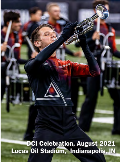
DCI Celebration, August 2021 Lucas Oil Stadium, Indianapolis, IN