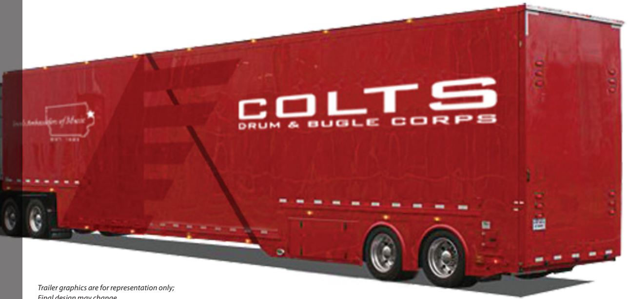
Trailer graphics are for representation only; Final design may change